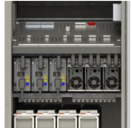
DC/DC converter modules and systems to OPUS cabinets