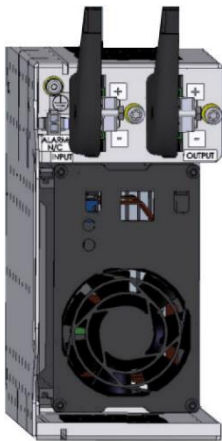
Rack mounting adapter Plug-in unit for OPUS racks