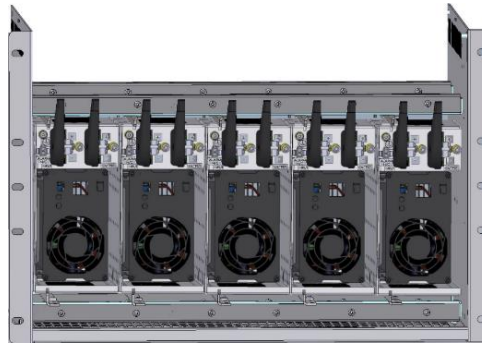
OPUS 19" 5U DC/DC Rack Converter systems 450W – 3750W